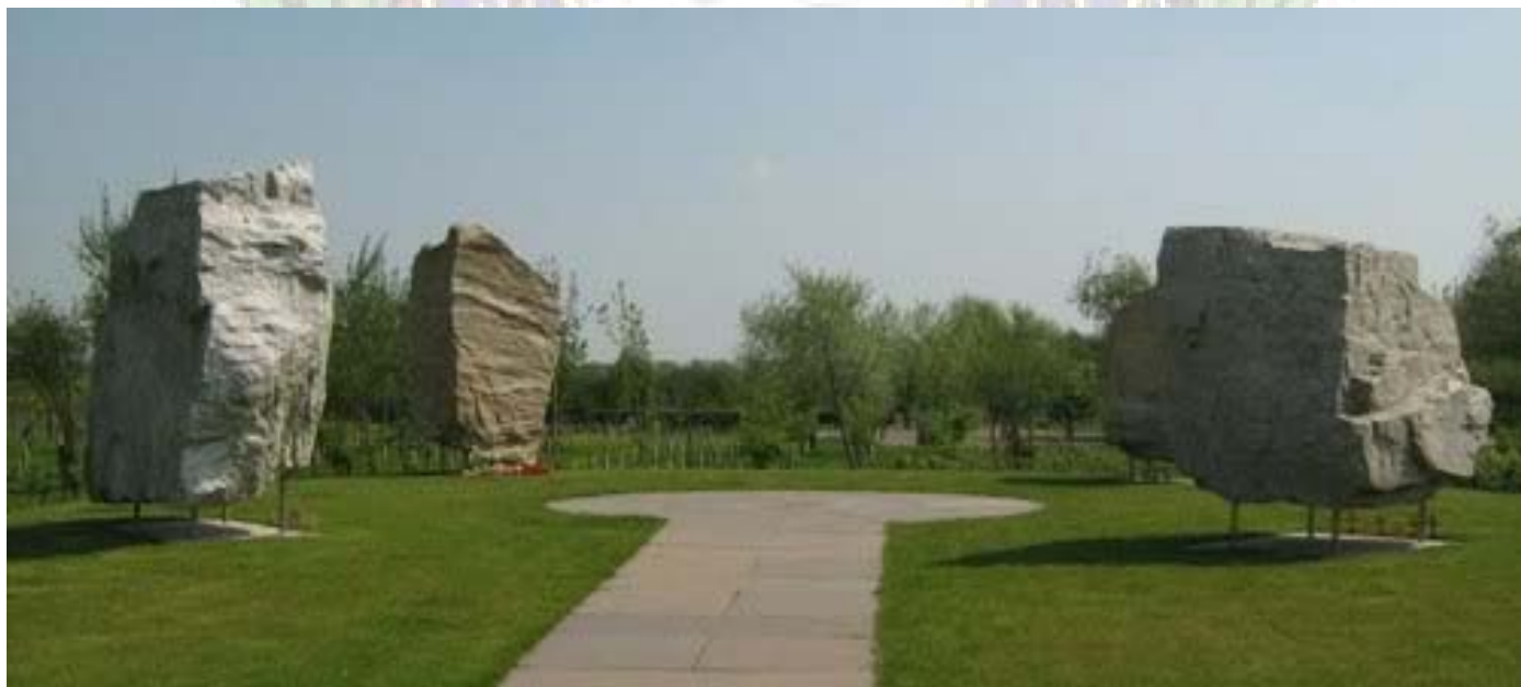
ROYAL ENGINEERS MEMORIAL, NATIONAL MEMORIAL ARBORETUM

12:30 for 13:00 in the upstairs function room